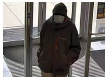
November 20, 2021