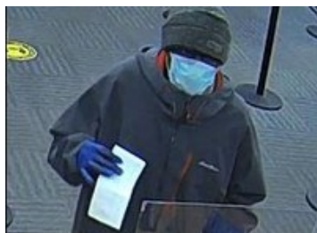
November 20, 2021