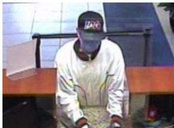
July 6, 2020