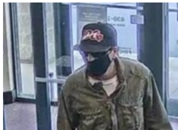
July 8, 2020