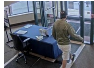
July 8, 2020