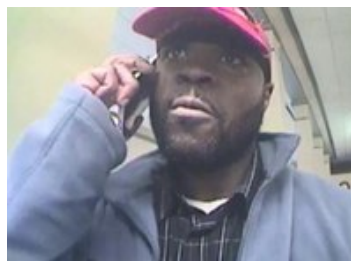
January 27, 2020