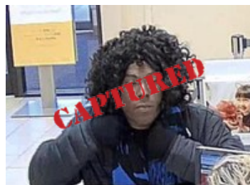
Gastonia January 7, 2020