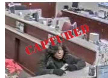
January 16, 2020