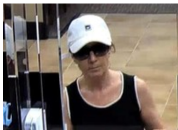
September 10, 2018