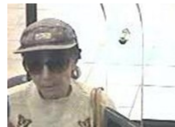
November 14, 2018