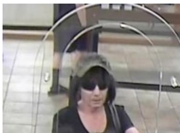
August 4, 2018