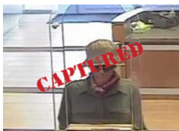
July 24, 2018