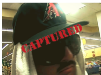
June 25, 2018