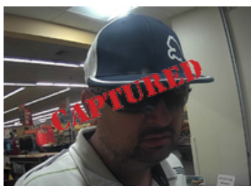
July 16, 2018