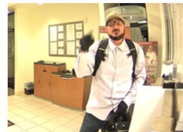
November 17, 2017