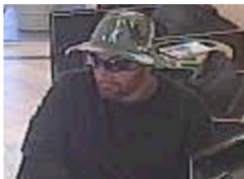
October 13, 2017