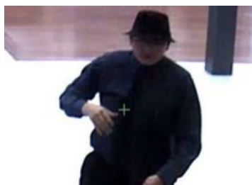
May 11, 2017