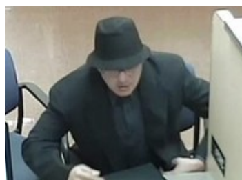
March 2, 2017