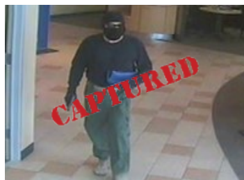
November 25, 2015