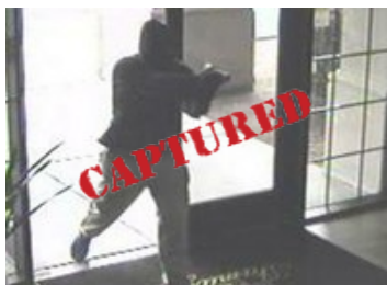
December 24, 2015