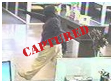
December 24, 2015