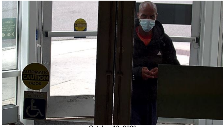
October 10, 2023