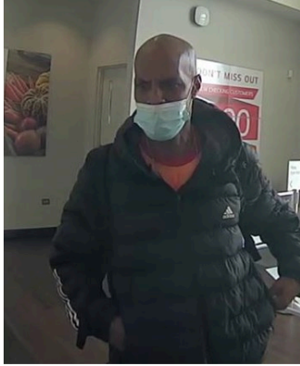
October 10, 2023