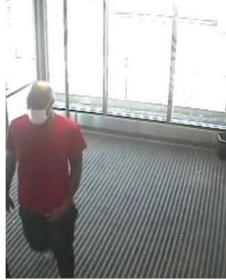
September 14, 2023