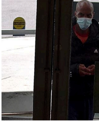
October 10, 2023